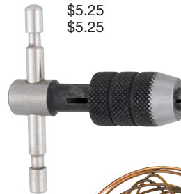
TX2006 $13.50 each