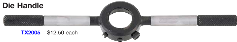
TX2005 $12.50 each